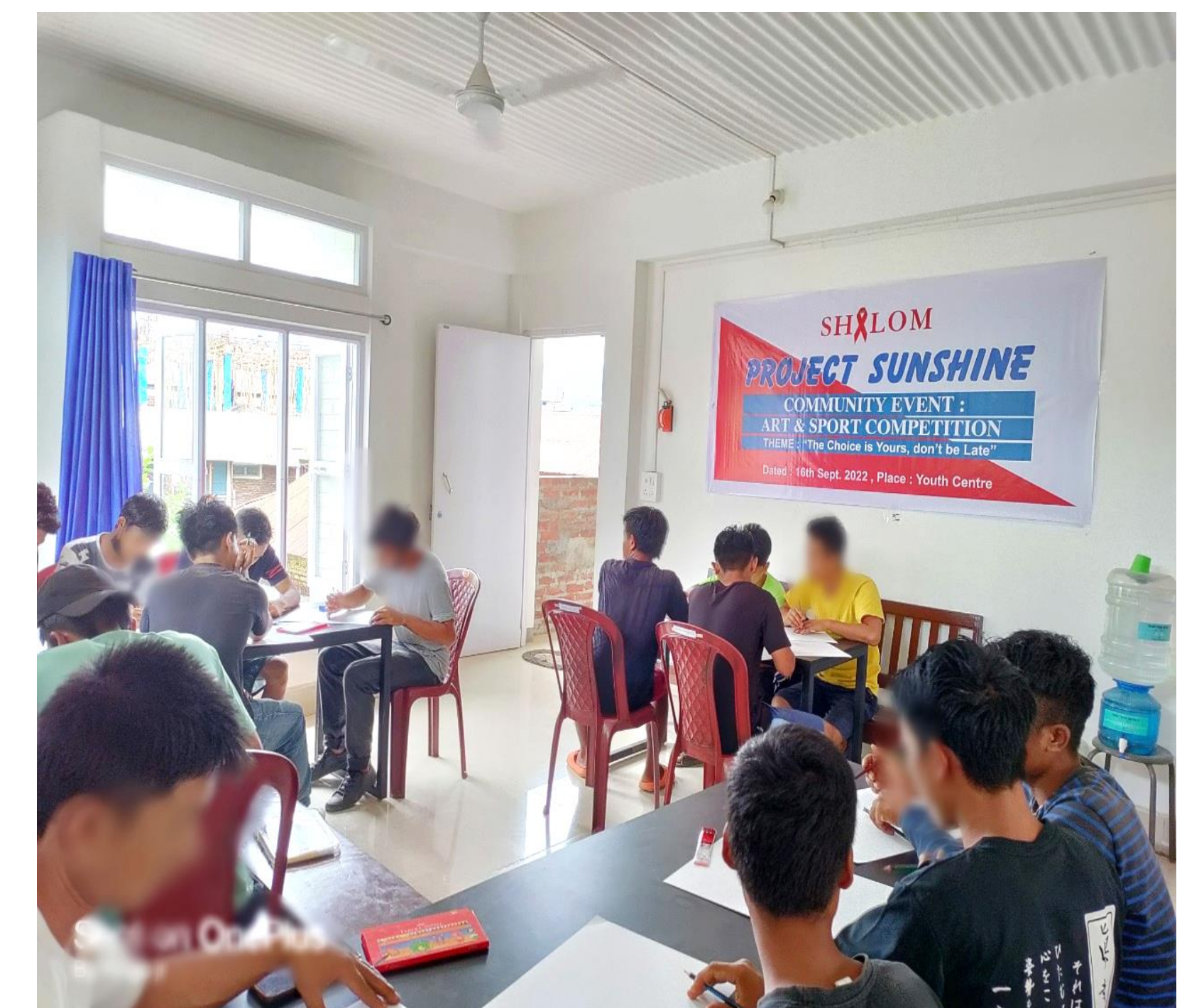
Community event being held at the youth friendly center at Churachandpur, Manipur.